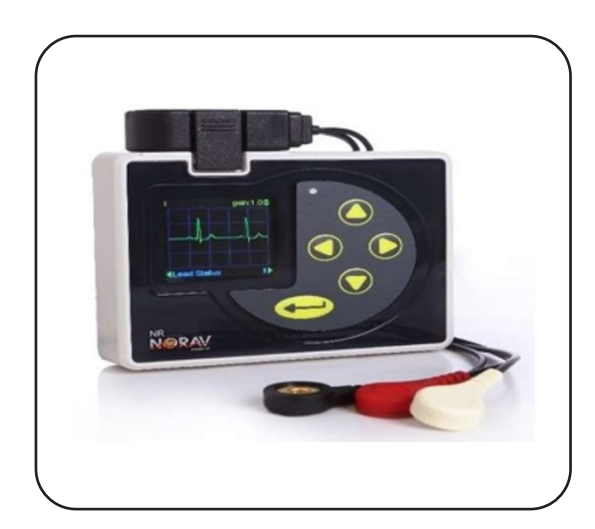
Holter ECG Analysis High End

At S.RG Medical, we provide an extensive range of medical equipment that meets international standards and caters to diverse healthcare needs. Our products include: