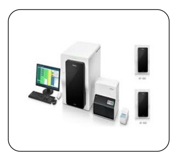
Automatic Microbiology Analyzer Model AF 300 Smart