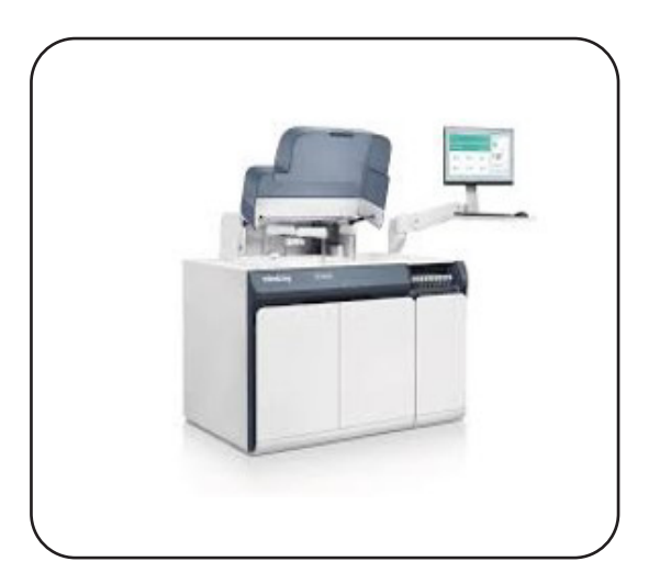
Chemitry Analyzer - Model BS 600 M